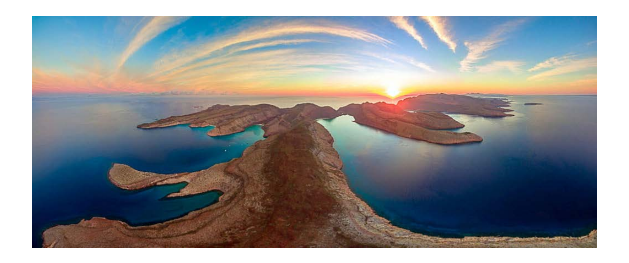
Click the picture above to see the amazing "Archipelago Espiritu Santo

For the last 25 years the Sea of Cortez has seen its reefs and reef fisheries decline at an alarming rate primarily due to illegal night time spear fishing using compressed air